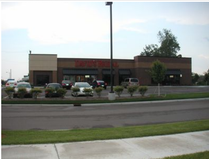
Davids N Face